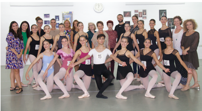
The inaugural Tanya Bayona Award, Malta