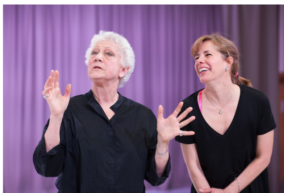
Double Dames –Monica Mason & Darcy Bussell